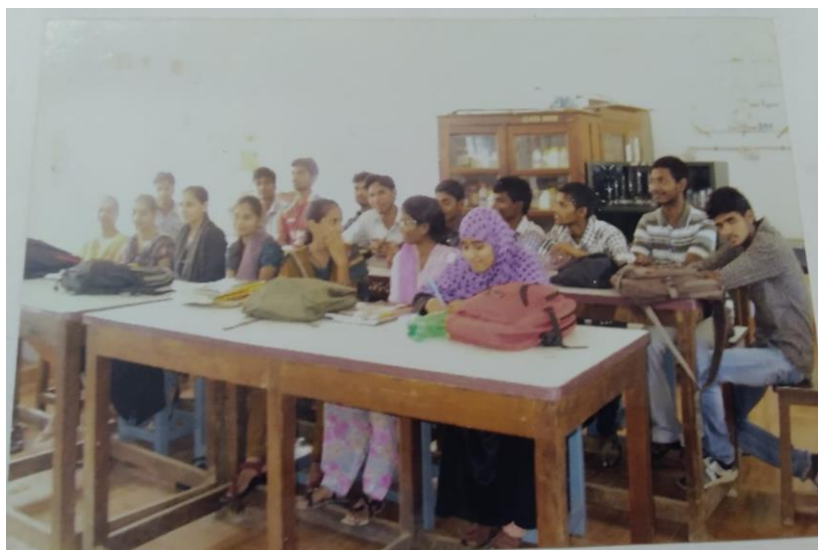
STUDENTS PARTICIPATING IN QUIZ